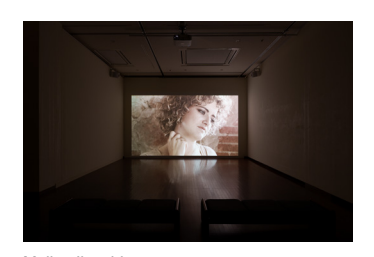
Maiko Jinushi A Distant Duet, 2016 Installation view of the exhibition "Universal / Remote"

Contemporary Art Museum, Kumamoto, 2023