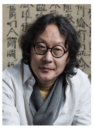
Xu Bing Studio

Among his solo exhibitions are Xu Bing: Found in Translation (Museum of Art Pudong, Shanghai, 2021-22) and Traveling to the Wonderland (Victoria & Albert Museum, London, 2013-14). In 2015, he received the Medal of Arts from the U.S. Department of State. In 2003, he was also awarded the Arts and Culture Prize of the 14th Fukuoka Asian Culture Prizes in Japan, among other internationally significant awards.