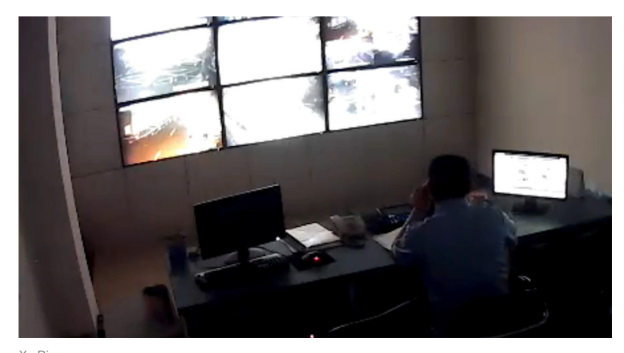
Xu Bing Dragonfly Eyes 2017

*The last screening (17:20-18:41) is available only on Fridays and Saturdays. Except for the above time, the making of Dragonfly Eyes will be screened (approx. 10 min).