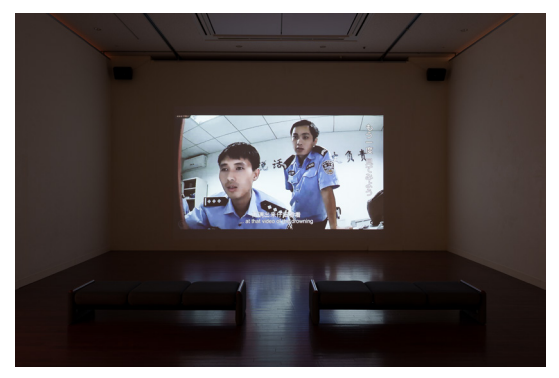
Xu Bing Dragonfly Eyes, 2017 Installation view of the exhibition "Universal / Remote" Contemporary Art Museum, Kumamoto, 2023

Strengthening of state authority and public acceptance of surveillance systems, so as to prevent the spread of disease and curtail the flow of people across borders, have achieved results in addressing the issues at hand, but remain major points of contention for the post-COVID society of the future. One could say our sense of balance between state power and individual freedom is being tested like never before. However, capital and information are sure to continue moving around the globe with increasing rapidity and acting as relentless drivers of humanity. There have also been recent moves toward adoption of cryptocurrencies and blockchain-based NFTs (non-fungible tokens), mechanisms that enable society to function and continue expanding even when people are physically separated. This section of the exhibition features works that focus on such issues of capital and information.