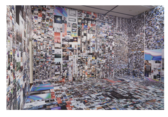
Evan Roth Since You Were Born, 2023 Installation view of the exhibition "Universal / Remote" Contemporary Art Museum, Kumamoto, 2023

Our society has continued to expand on a global scale even during a pandemic. However, strangely and paradoxically, isolation of the individual is also progressing. Today it is thoroughly commonplace for individuals to connect and reach across borders online, without leaving the comfort of their homes. The COVID crisis accelerated a paradigm shift toward the remote, and moving forward, our sense of geographic distance will surely continue to fade in the future. The figure of the worker laboring silently for the sake of a world to which he or she lacks connection, and will never see or actually visit, conveys isolation and profound loneliness, and this cannot fail to have a major impact on the human psyche. This section explores how people work and live in increasingly remote ways premised on contact-less interaction.